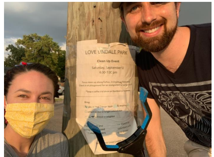
Keep an eye out for Love Lindale Park events.