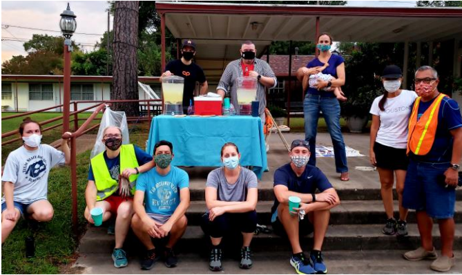
Some of our dedicated volunteers enjoyed refreshment by Canary Café after the cleanup.