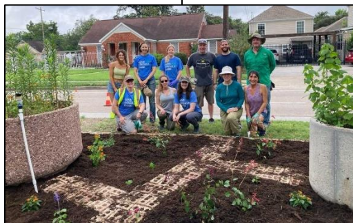
Butterfly Garden Crew